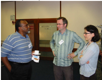
Below: Mobility Conference