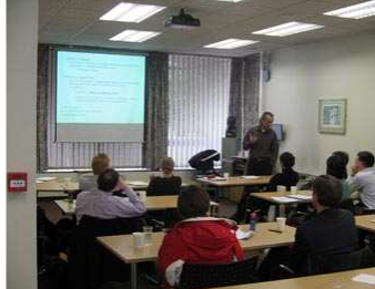
Above: Institutions Workshop